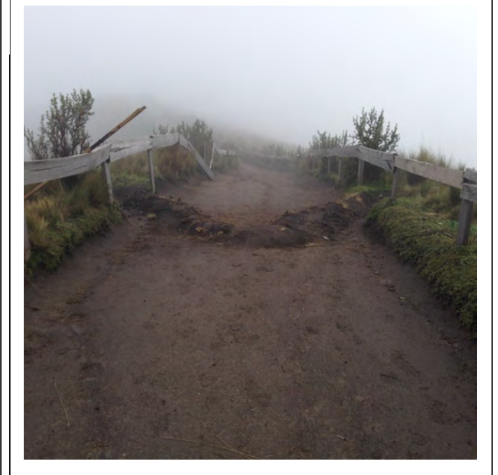
Above : As explained by Curmudgeon (at left), water drains upward in the Southern Hemisphere, or at least, in Ecuador. In this picture, presumably water would run up the hill until it hit the center of the bar and then drain upwards and off to the sides.

Of course nailing down the projects and dates is still in the works. If you are considering volunteering this year check our website often for information and updates.